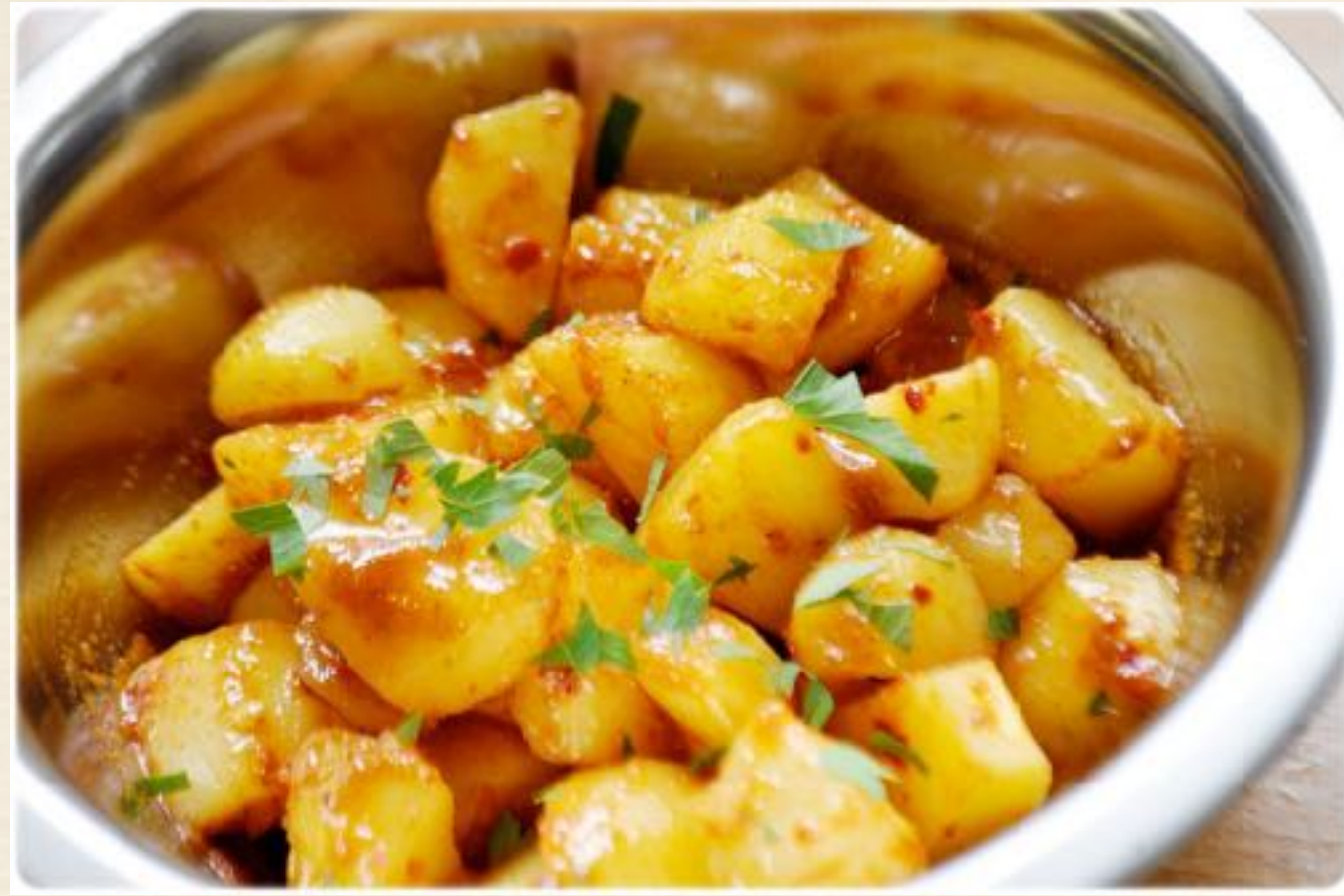
Potatoes with Harissa salad