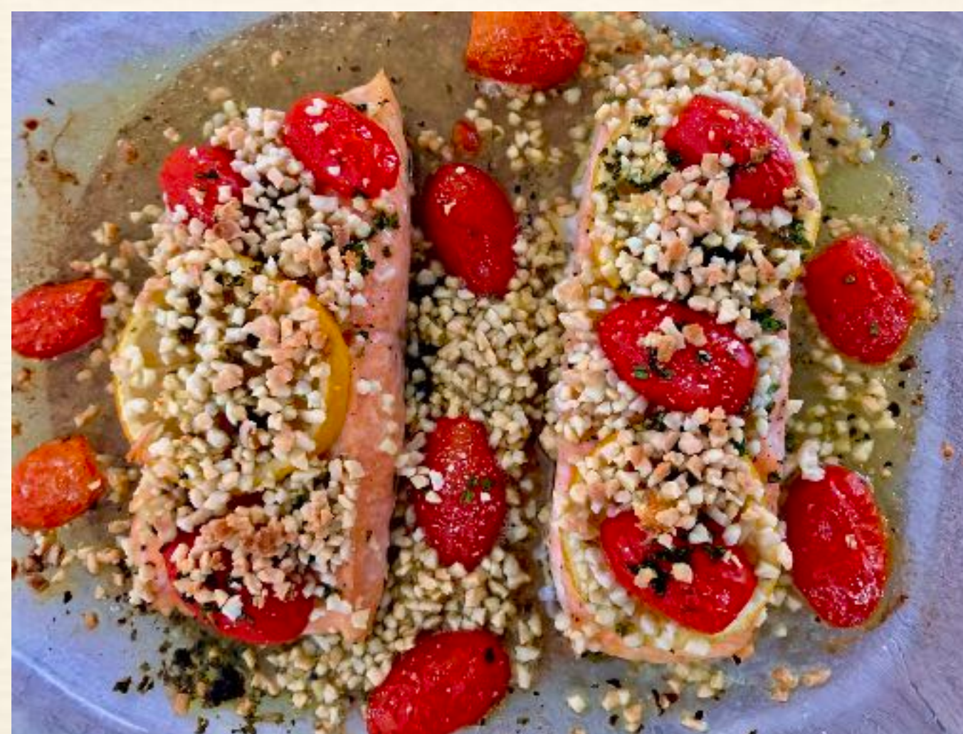
Saumon Citron au Four