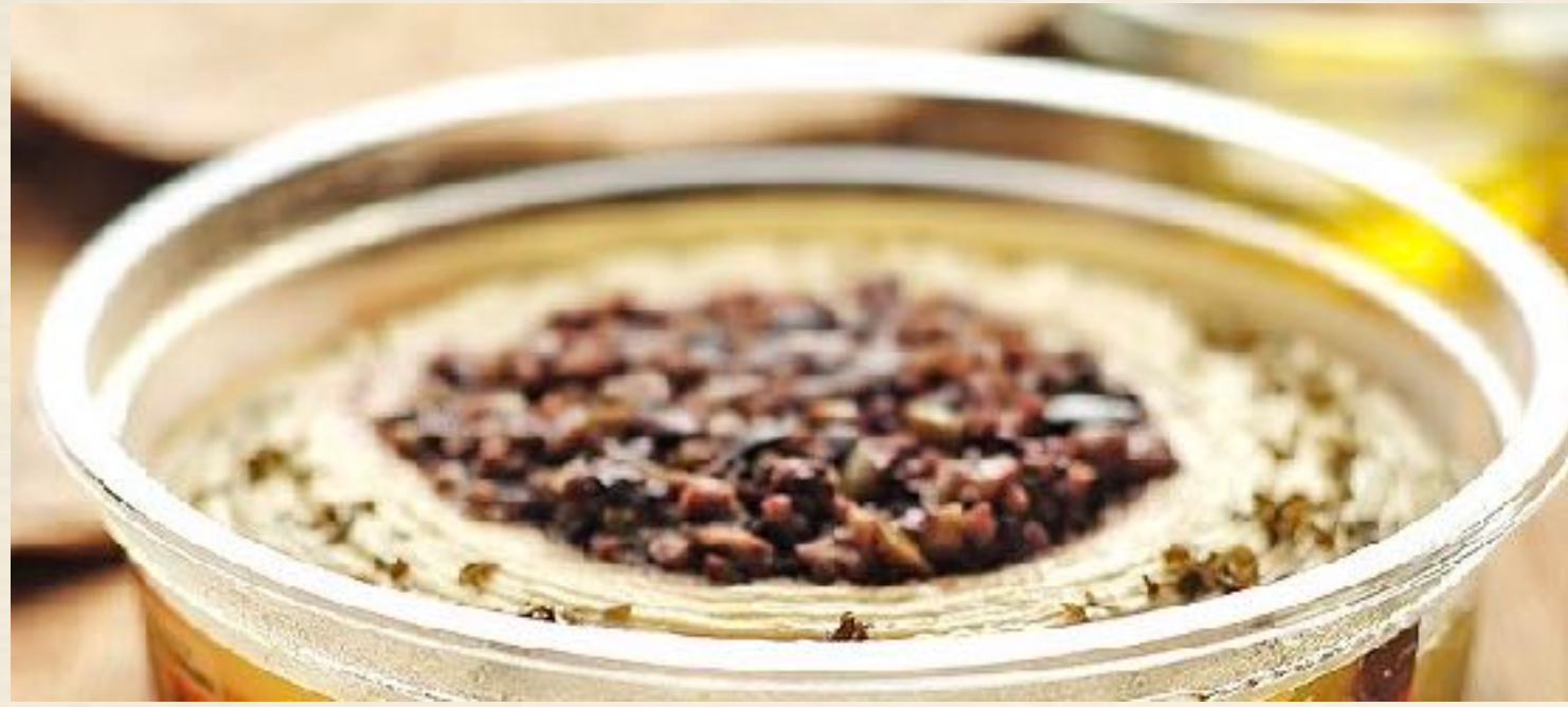
Hummus with olives