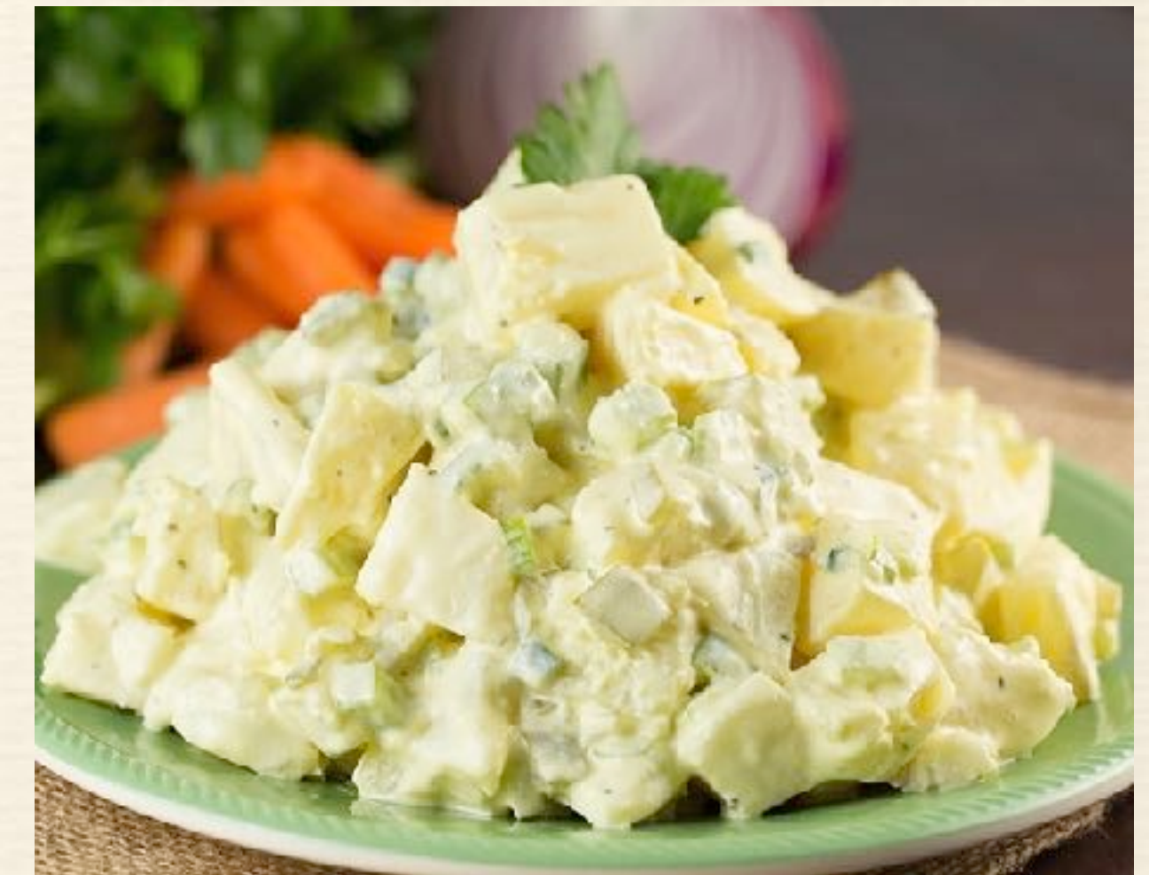
Potato and egg salad