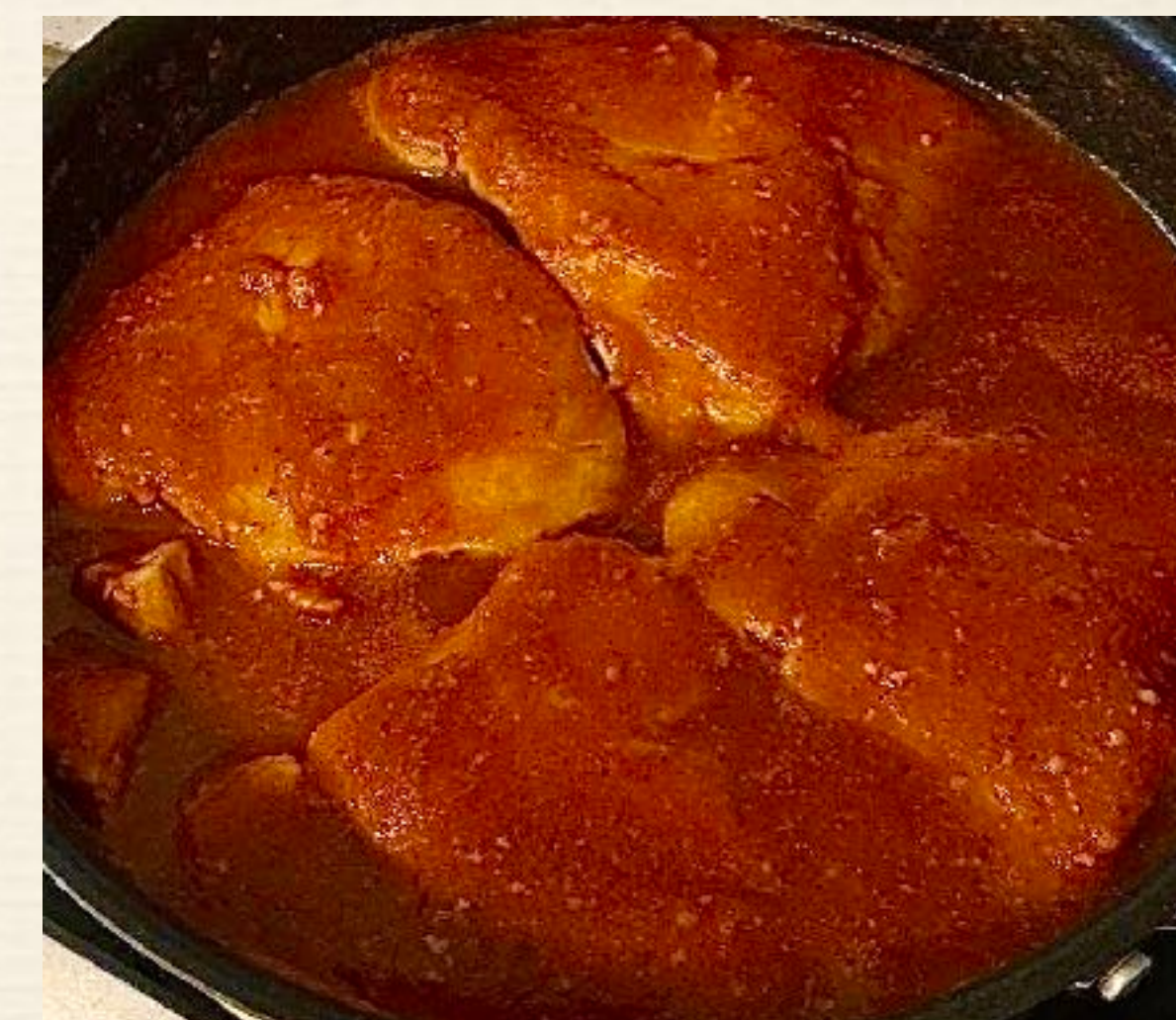
Thon Hraïmi - 'Malin'