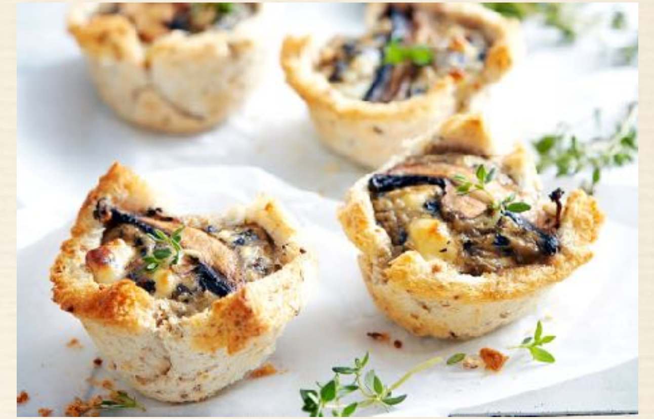
Quiches aux Champignons