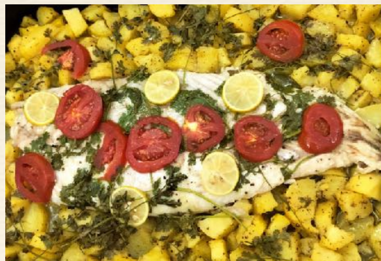
Bar au Four