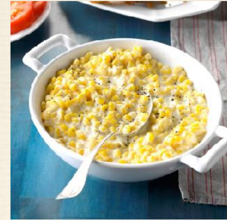
Corn and hearts of palms